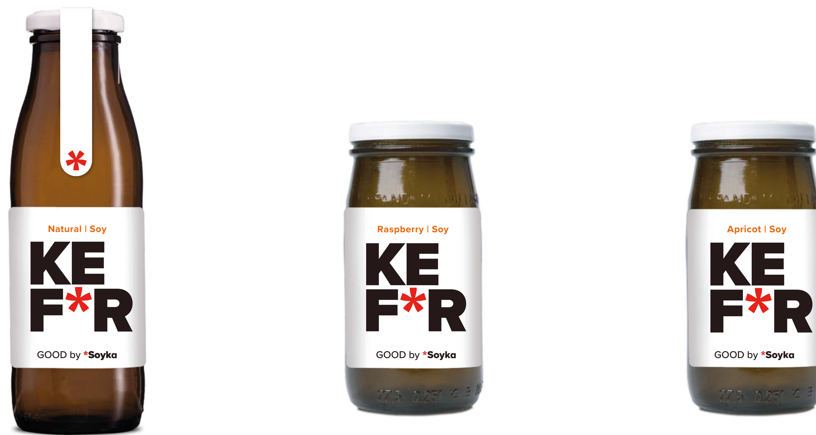
Fermented Soy Drink Natural 500 ml