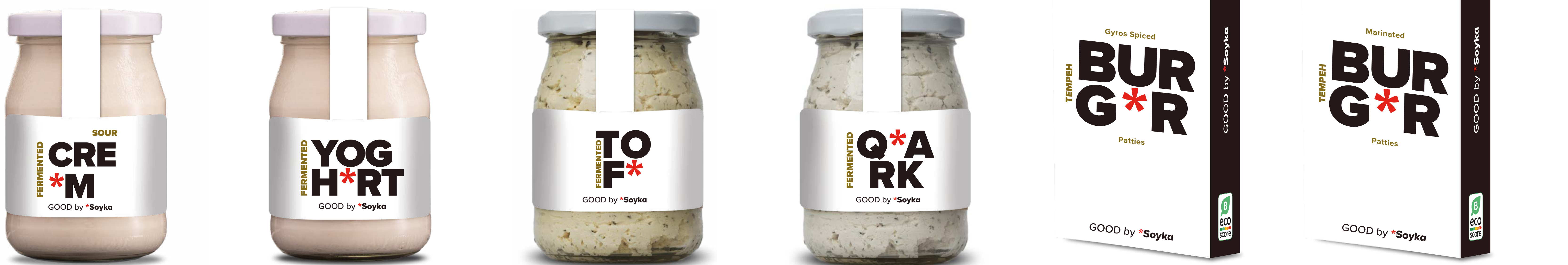
Soy Alternative of Sour Cream 16 % 250 g