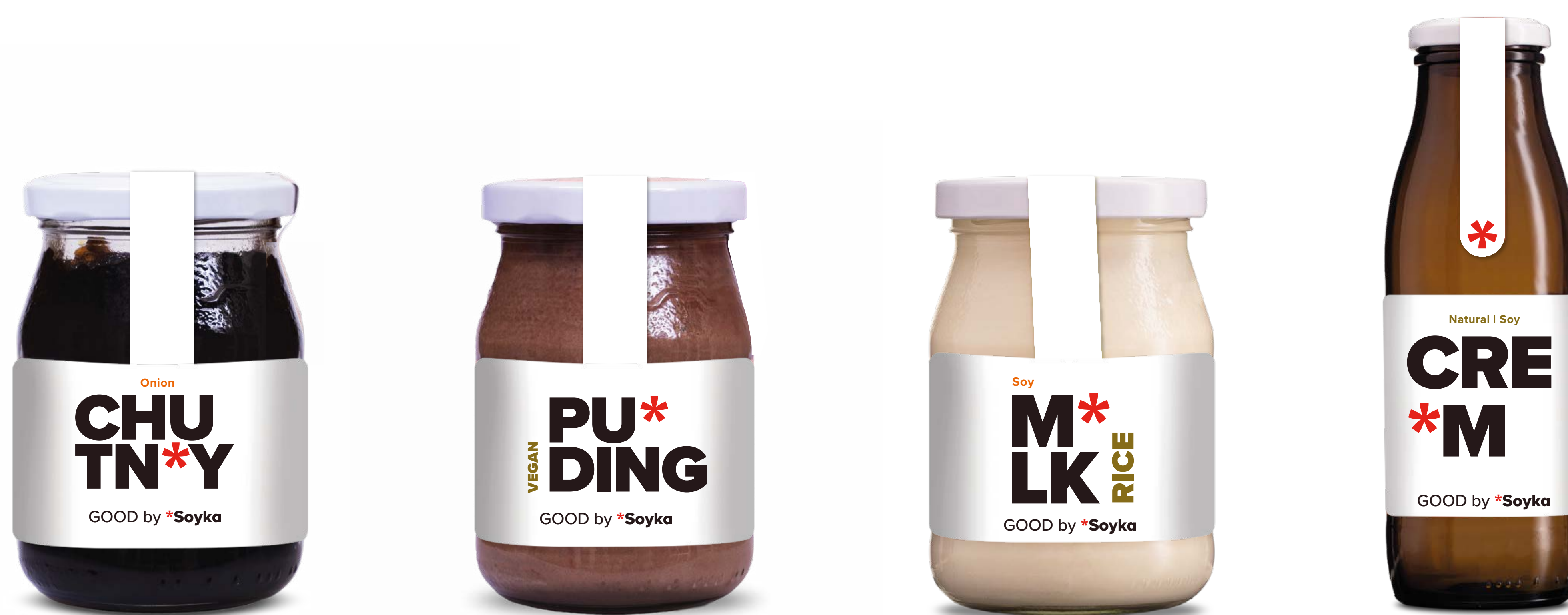
Onion Chutney 300 g