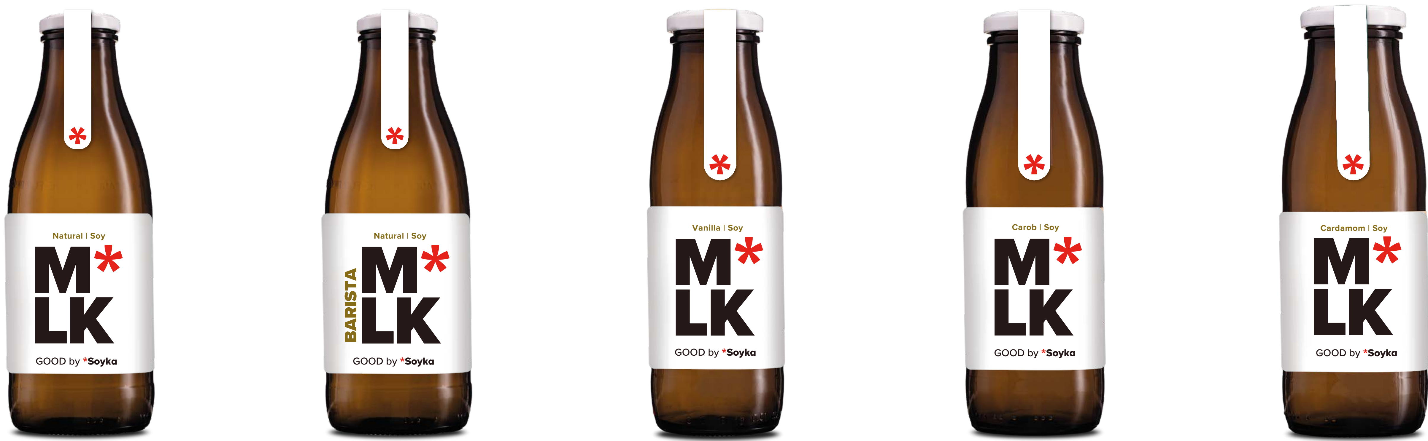
Full Fat Soy Drink Natural 500 / 1000 ml