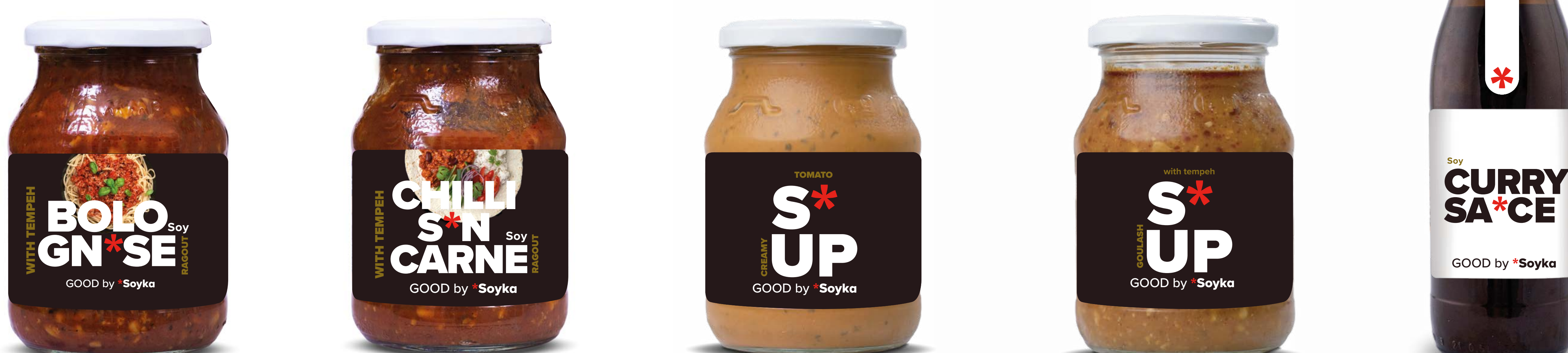
Vegan Bolognese with Tempeh 500 g