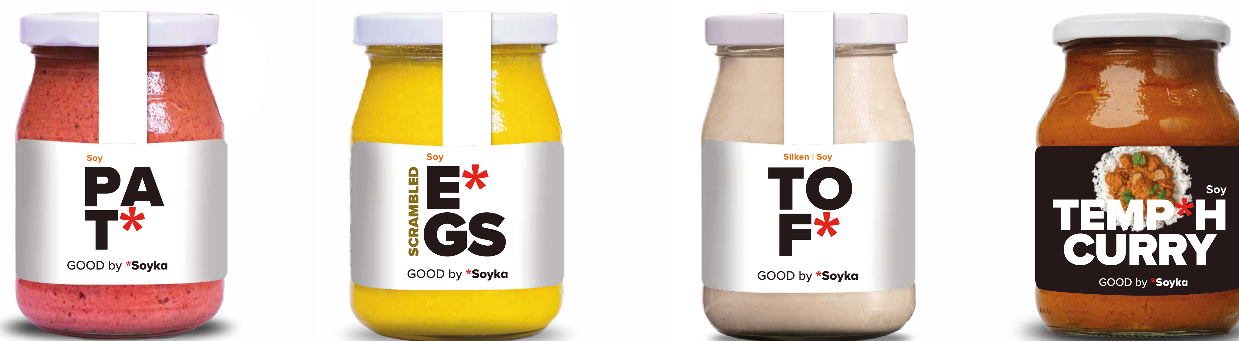
Vegan Pate 250 g